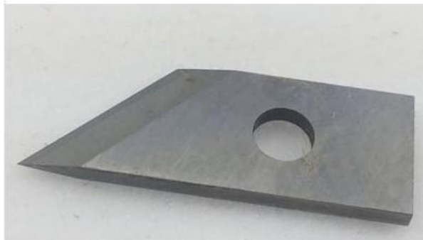
TL-052 DCS knife