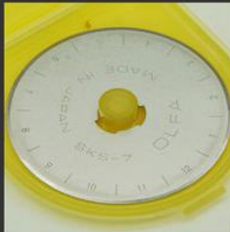
TL-004 1.75" For DCS2500