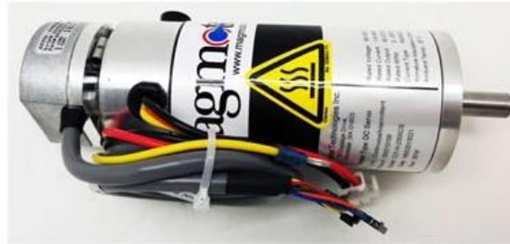
A-CR2-194-50 Motor Assy