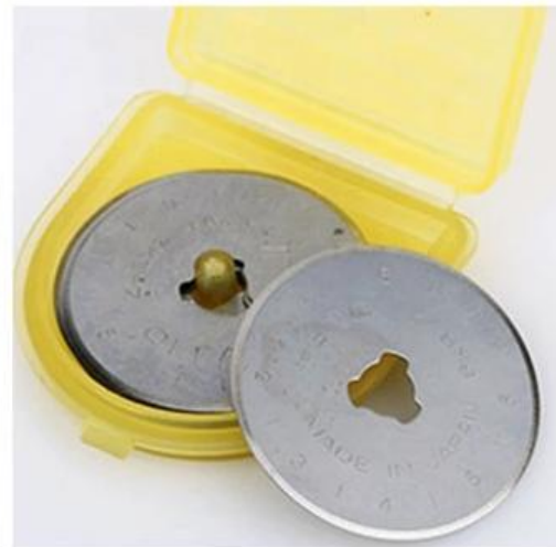
TL-001 Round Knife