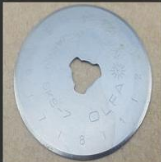
TL-001 1.1" For DCS2500 & DCS3500