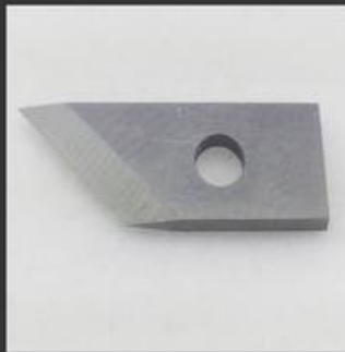
TL-052 0.040" 45 degree For DCS2500 & DCS3500