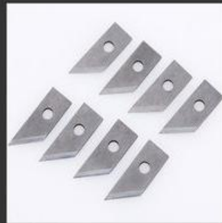
TL-055 0.020" 45 degree For DCS2500 & DCS3500