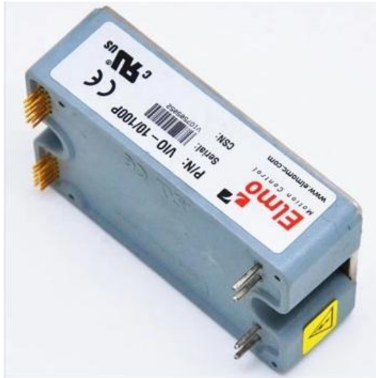
CB2-103 MINI DC SERVO AMP